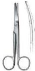
Mayo Scissor 14 & 17 cm BL/BL CVD

Mayo scissors come various lengths. Their construction is extremely durable, and Mayo scissors are used to cut connective tissues, fascia and sutures, primarily. The tips are semi-blunt, and they are available in curved or straight styles.