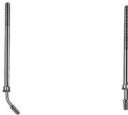
Poole Aspiration Tube 8 mm / 23 Fr 23 cm