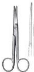
Mayo Scissor 17 cm, BL/BL STR