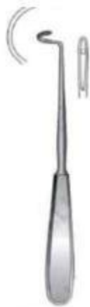
Deschamps Ligature 20 cm BL, CVD (R)