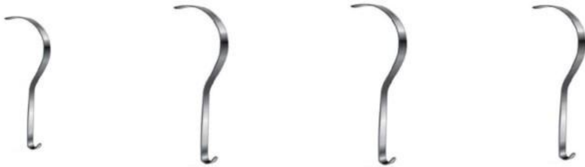
Deaver Retractor 18 cm 19 mm