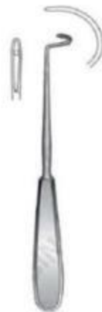
Deschamps Ligature 20 cm BL, CVD (L)

Deschamps Ligature Needle is a specialized device that surgeons in multiple areas use to place, mobilize and tie suture threads around blood vessels or aneurysms, in order to achieve adequate haemostasis.