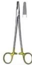
Mayo Hegar Needle HLDR 20 cm TC 0.5 mm

Mayo Hegar Needle Holder is used to drive curved needles during surgeries. It has a broader jaw with a rounded tip. These needle holders have straight and cross-serrated inserts which provide greater precision during the suturing process. These needle holders are available in different sizes and variations.