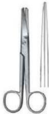
Mayo Scissor 15 cm STR