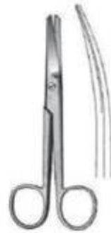
Mayo Scissor 15 cm BL/BL, CVD

Mayo scissors come various lengths. Their construction is extremely durable, and Mayo scissors are used to cut connective tissues, fascia and sutures, primarily. The tips are semi-blunt, and they are available in curved or straight styles.