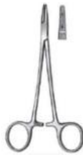
Crile Wood Needle Holder 18 cm

Crile-Wood Needle Holder is used to hold and guide small to medium size needles and suture materials. The Crile-Wood Needle Holder has a gently tapered, blunt tip and is generally more delicate than the Mayo-Hegar but slightly less delicate than Webster, Halsey, or DeBakey needle holders.