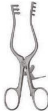
Weitlaner Retractor (Self Retaining) 130 mm (5 1/8") 3X4 Prongs, BL

Weitlaner Self Retaining Retractor is a specialized instrument commonly used to retract incisions for better surgical access. It does so with minimal damage to the underlying tissues. Commonly used in general, neurological, spinal and orthopedic surgeries.