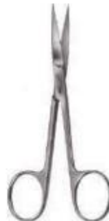
Delicate Scissors Straight 120 mm (4 3/4") SH/SH

Delicate Operating Scissor is a multipurpose instrument that is used for sharp dissection of sensitive tissues. It is commonly used for dissecting organ tissue in Neuro, Plastic, ENT and General surgeries.