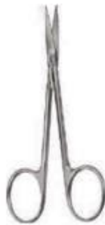
Delicate Scissors Straight 110 mm (4 1/4") SH/SH