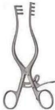
Weitlaner Retractor (Self Retaining) 165 mm (6 1/2") 3X4 Prongs, BL