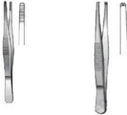
Forceps Narrow Dress 14.5 cm