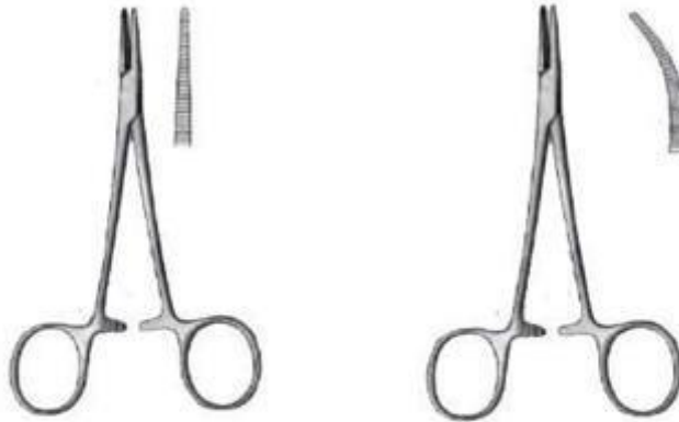
Halsted Mosquito Forceps 12.5 cm, STR